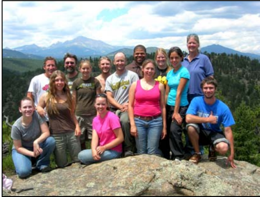
Class of 2007 at Cal-Wood

Earn 6 relicensure credits in the foothills of the Rocky Mountains at the spectacular 1,200-acre, private Cal-Wood Education Center